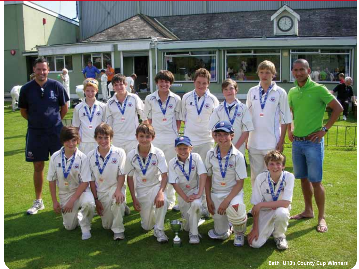
Bath U13's County Cup Winners

Everyone involved played a valuable part so you should be proud of your efforts. There's great potential in the squads so you can look forward to moving on from what you have achieved this year and aim to make next year another successful one.