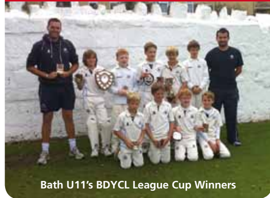
Bath U11's BDYCL League Cup Winners