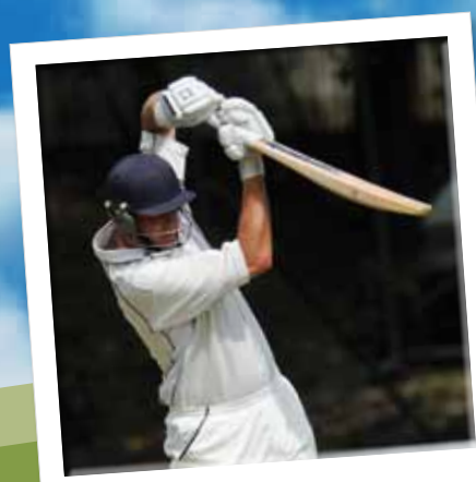
4. Ben Staunton