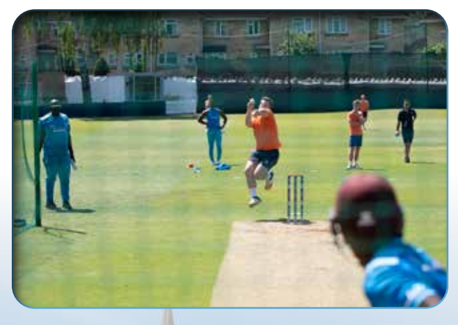
Glorious sunshine greeted the 2019 World Cup squads of both Pakistan and the West Indies. Over two days in May the club hosted some of the best one-day cricketers in the world.

The club's superb training facilities were put to the test – and passed with flying colours.