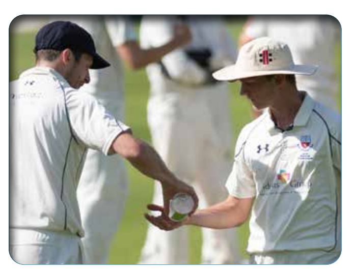
the year for the 4th XI to continue blooding new talent into the challenges of senior cricket.

2020 should have been the year to further inspire the next generation. It should have been the year for the dreams evoked by 2019's plethora of highlights to be realised by the upcoming cricketers of tomorrow. It should have been the year where progress on the new development at the club started to ramp up. It should have been the year when the 2nd and 3rd XI's embarked on new adventures in higher rungs of their leagues. It should have been the year the Wanderers continued to prove there is no better club to play women's cricket at. It should have been the year the 1st XI tried to go one better in the league and built off last year's National Cup runs and it should have been