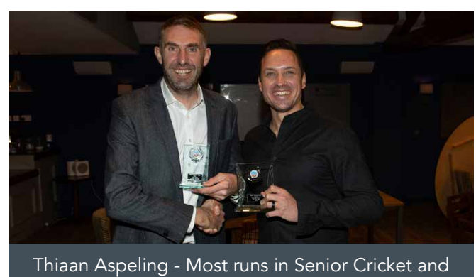
4th XI Players Player of the Year